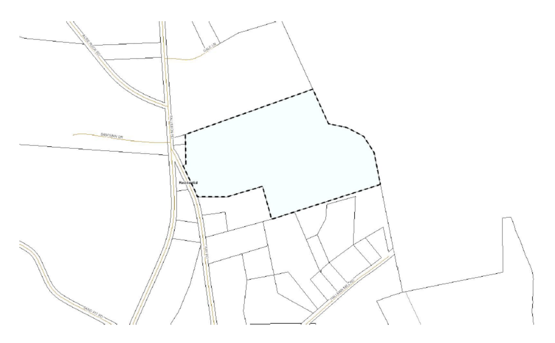
CASE # 21-10 Rezoning Residential to Light Industrial Conditional Use Property Location: 134 Kay Road Parcel Number: 52468

Property Location: 134 Kay Road Parcel Number: 52468 Acreage: 41.355